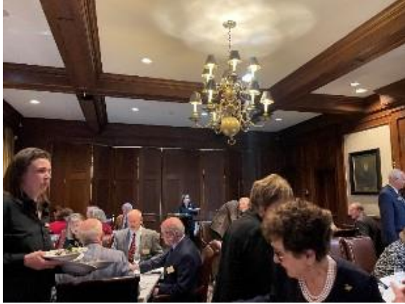
Legatus members dining at the El Paso Club